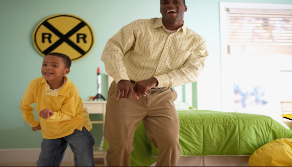
Dancing with Daddy— June 27, 2012