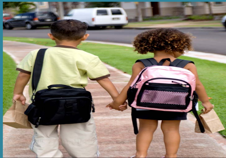
Back to School Bash- Aug. 22, 2012