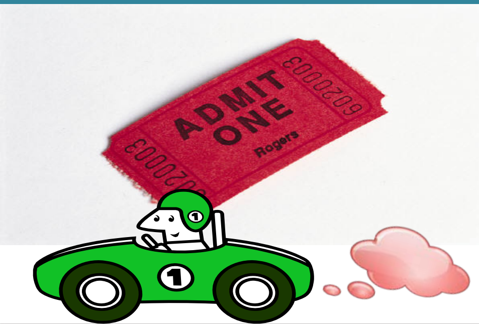
Drive- In Movie Night- July 25, 2012